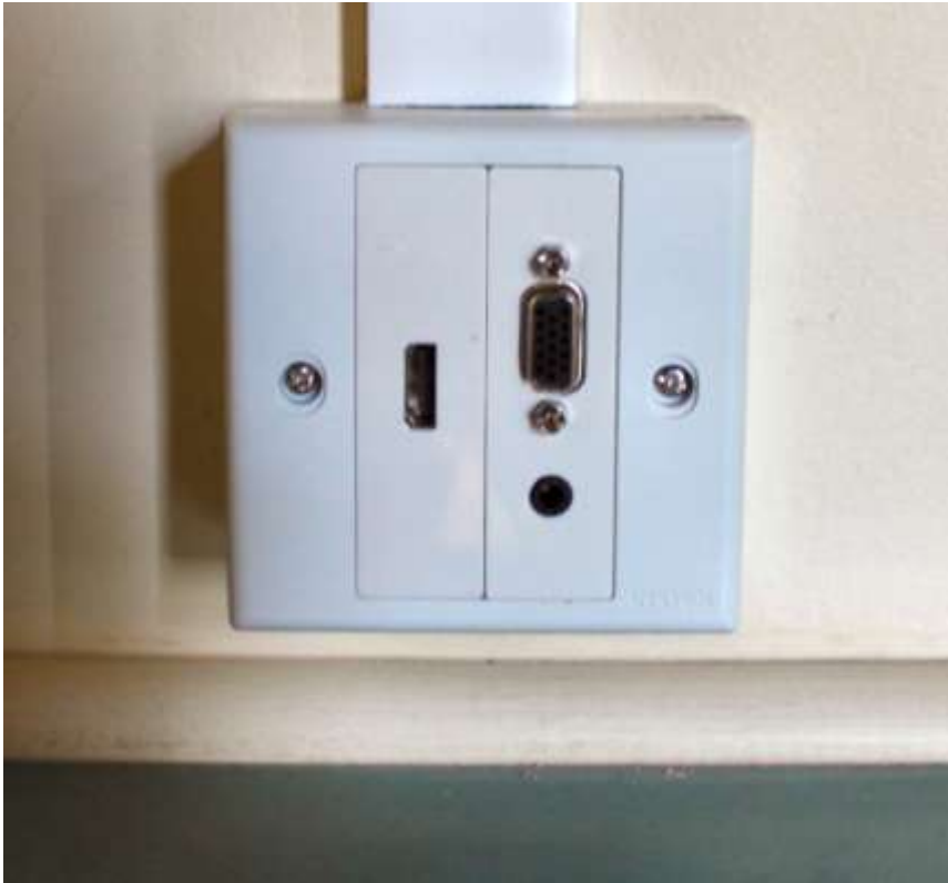
Wall mounted socket-the socket on the left is for HDMI. The other is for VGA, below this is the Audio-in socket (3.5mm)

Switch on power to the projector using the switched plug in the adjacent equipment cupboard. Switch on the projector, using the Power on/Off button on the REM. You will hear a bleep from the projector confirming the instruction. After a few moments the Projectors stand-by screen will appear in the projection area of the wall.