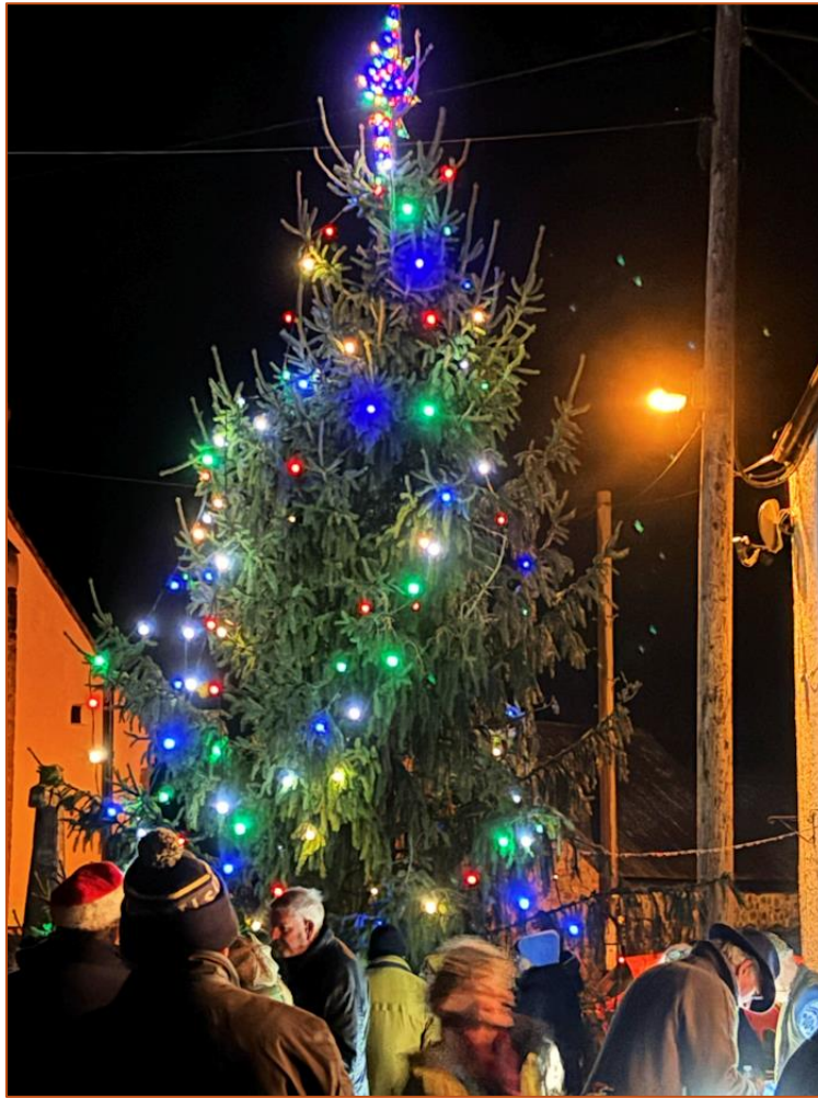
The lighting-up of the Christmas Tree last Sunday attracted a good crowd.