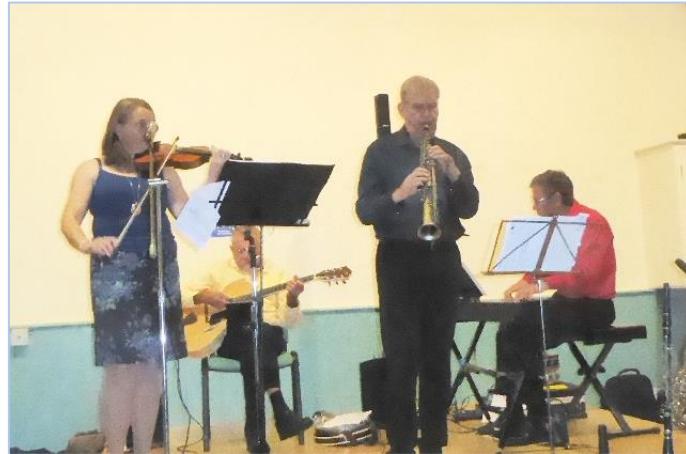
The quartet from the Sunset Café Stompers, playing at the Harvest Festival Supper, brightened up the end of a very wet day.